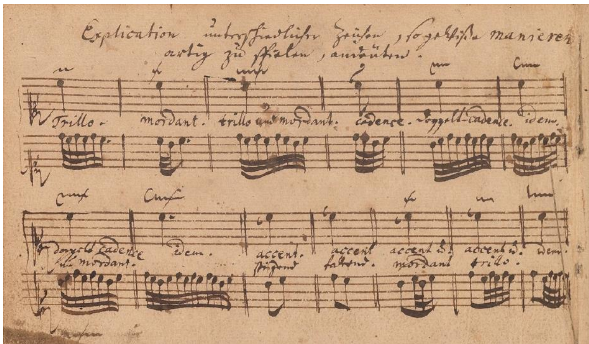
Tabla original de J. S. Bach / Original table by J. S. Bach